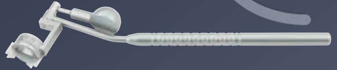
E9030 Pendulum Toric Marker